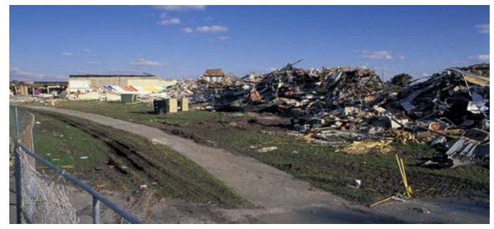
Tornado damage in Kissimmee, FL.

Construction workers build a steelreinforced concrete safe room, which will be placed inside a home. Many safe rooms are prefabricated like this example and are transported to homes throughout the U.S.