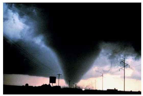
A Tornado near Dimmit, Texas in 1995.

A tornado is a violently rotating column of air extending from a thunderstorm to the ground. In an average year, about 1,000 tornadoes are reported across the United States, resulting in 80 deaths and over 1,500 injuries, according to the National Oceanic and Atmospheric Administration. The most violent tornadoes are capable of tremendous destruction, with damage paths as wide as a mile and as long as 50 miles and wind speeds of 250 mph or more. Destruction of homes, crops, and utility infrastructure cost the U.S. hundreds of millions of dollars every year.